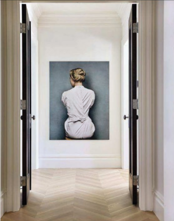
TOP LEFT: Double doors and graphic photography instill a gallery vibe in the entry to the principal bedroom. Flooring (throughout), Nu-Way Floor Fashions; photograph by Billy & Hells, Lumas.