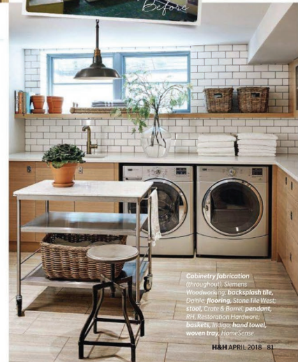
Cabinetry fabrication (throughout), Siemens; woodworking , backsplash tile, door , flooring, Stone Isle West; stool , Crate & Barrel; pendant , RH; restoration hardware , baskets , Indigo ; hand towel , woven tray , HomeSense